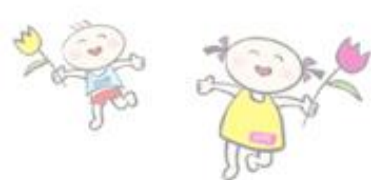
Banner on CCF's home page